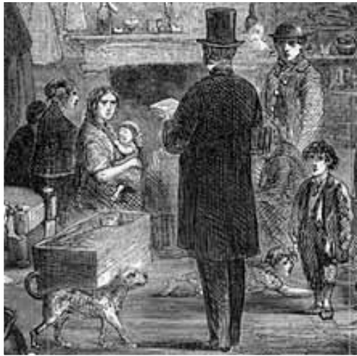
A census enumerator in a Gray's Inn Lane tenement, London